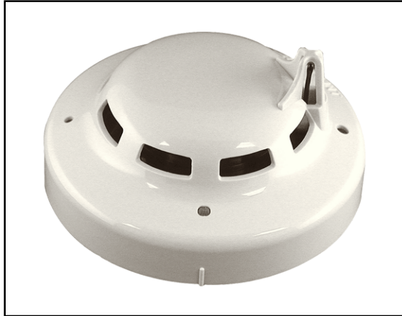
Shown without base